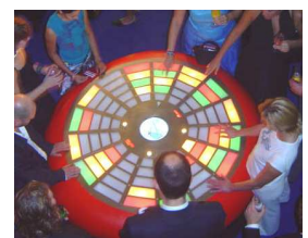
(b) A movie festival