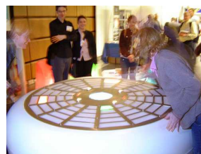
(a) CHI 2004

Moreover, in festivals and events (conventions, conferences) there is a need for public games to enhance the overall experience for the visitors. It demands different designs and implementations in comparison to the traditional machines used in public spaces such as bars and cafés [9]. It is more important to stimulate the social interaction between visitors. People in different mind sets, moods and physical capabilities encounter each other in these public events [3] and more social interaction would enhance the social atmosphere hence the effects of these public events. Ensuring durability and robustness of the product without compromising the quality of physical and tangible interaction with traditional games is a challenge not many have achieved for a market-ready product. Other aspects such as social and face-to-face collaboration between multiple users add more to the list of the requirements. One of the products that aim at these requirements and are available in the market is a game installation called PainStation [7], however it supports no more than two players playing together. Jam-O-Drum [2] and Jam-O-World [1] are table-top designs for group interaction and public use, but they are designed for musical play other than a generic game platform.